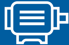
Motor & Gear